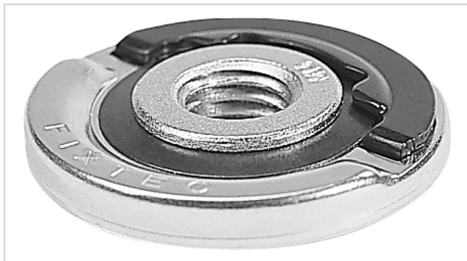
For tool-less disc change, suitable for discs from Ø 115-150 mm.