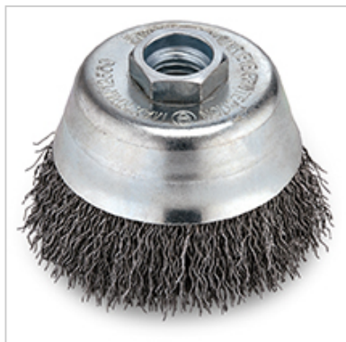
Corrugated, mount M 14